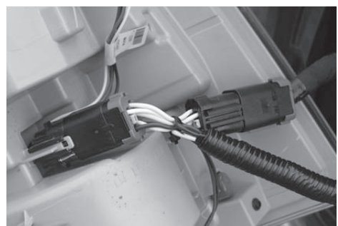
4. Locate a clean and accessible mounting location on the vehicle near the RV harness ends within reach of white wire and ring terminal. Remove any debris or undercoating to expose a clean metal surface and drill a 3/32" hole.

3. Starting on driver's side position the RV harness with connectors containing Yellow wires up from behind taillight opening and between separated vehicle harness connectors shown in Figure 2 . Press connectors firmly into the vehicle connectors until they lock into place. Pull on connectors to ensure the locks are engaged.