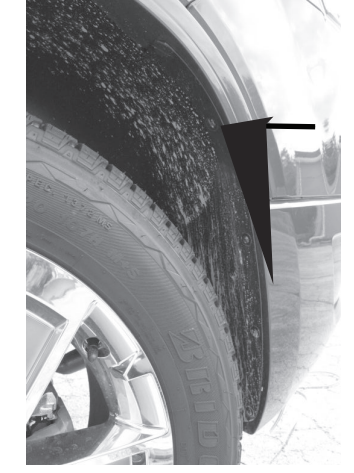
Figure 4 12. Starting at the left side of rear driver's side wheel well route a fish tape up and over to the right side. Secure the 4-Flat connector to it and pull through the wheel well cover. 13. From front of wheel well route to brake lines and secure with

11. Remove Torx T15 screw on drivers rear wheel well cover shown in Figure 4 . template mark the two holes and drill two 3/32" holes and attach the bracket using the two remaining screws