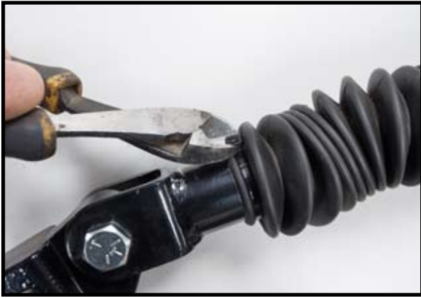
1. Cut plastic tie off of rubber boot on clevis end.