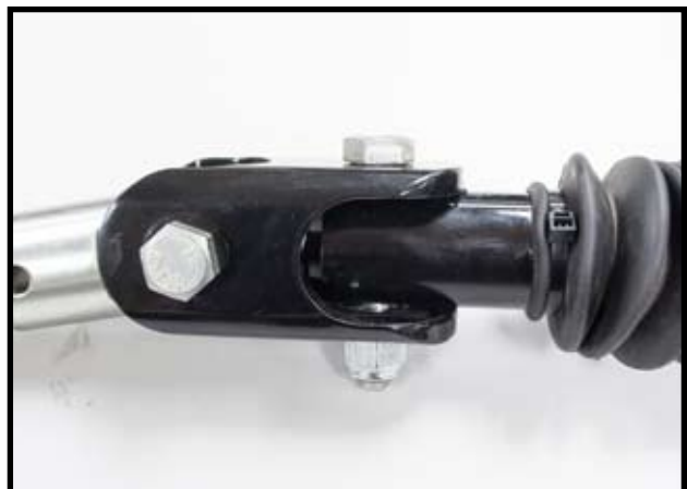
6. Bolt tableless clevis to adapter making sure not to over tighten, the clevis should rotate freely.