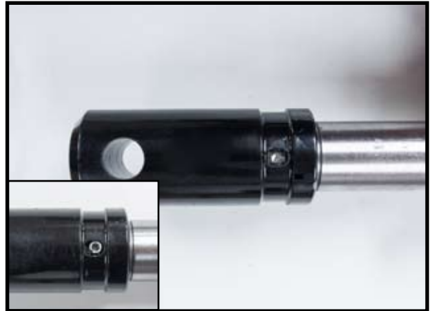
4. Clean the threads and apply some thread lock to threads. Turn on the tableless adapter on shaft until it threads on all the way. Turn off until the hole in shaft lines up with hole in adapter. Drive the new roll pin in hole until flush with adapter.