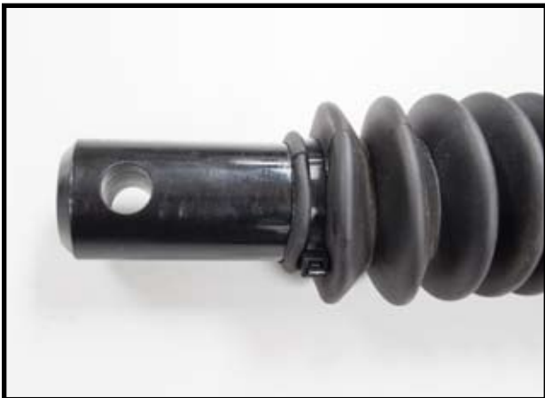
5. With the hole facing up with tow bar, place the rubber boot over adapter and use the supplied plastic tie to clamp boot to adapter. Cut unused plastic tie.