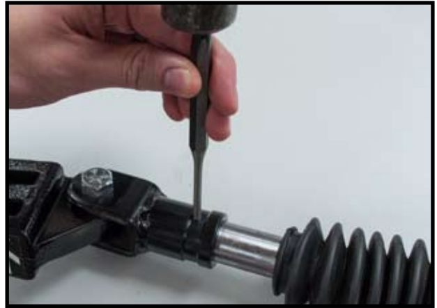
2. Use punch to drive out roll pin.