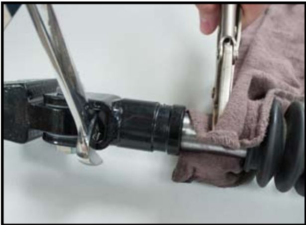
3. Use a vise grip with a rag or bench vise with rag to hold shaft and use a rod or wrench in the clevis to turn off clevis assembly.