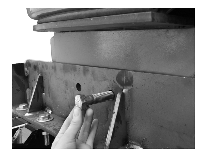
4. Install 7/8" x 3.00" bolts and nylon lock nuts into drilled holes and tighten to specified torque.