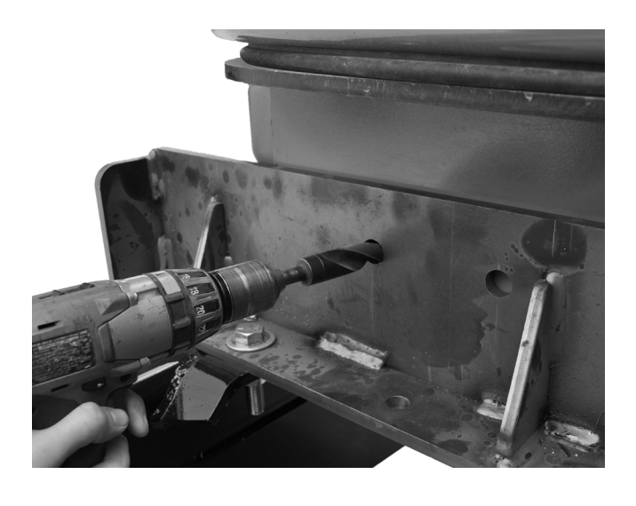
3. Center punch the drilled hole location and use a 29/32" drill bit to drill holes. Be sure to check for hose clearance on reverse side before drilling.