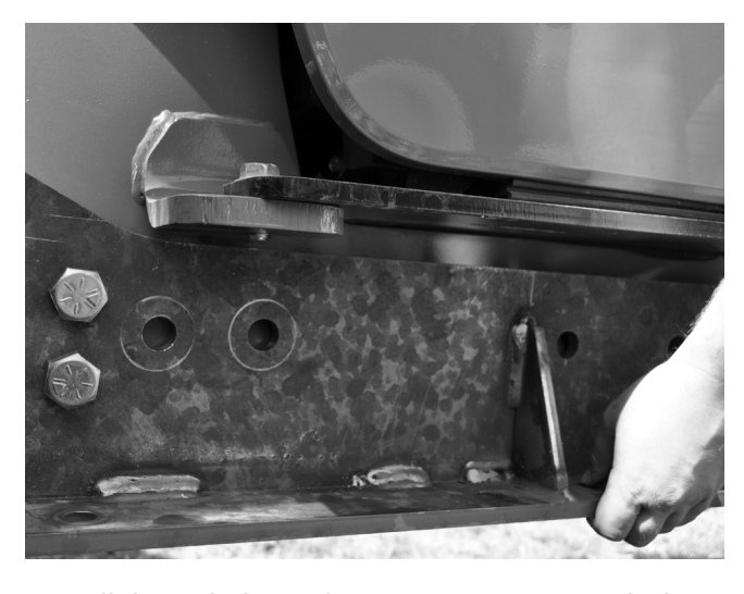
2. Install the right baseplate using 7/8" x 3.00" bolts and nylon lock nuts. Repeat for opposite side. Tighten 7/8" bolts to specified torque found on front cover.