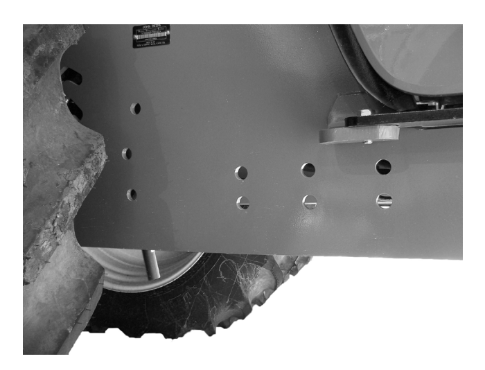
1. Install John Deere's front axle support kit for tractor mounted tanks.

Preparation : Remove any loader/blade brackets from the tractor. The tractors duals must be set to 120" wheel spacing for mounting SideQuest.