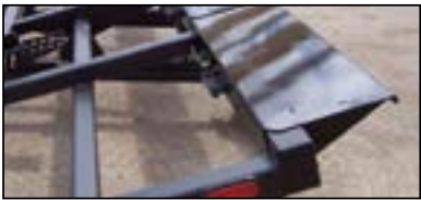
Optional top rail extender kit

Standard telescoping tongue and eZ-Latch 2 5/16" ball coupler and safety chains