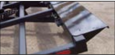
Optional top rail extender kit