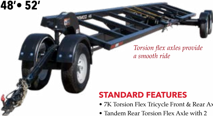
Torsion flex axles provide a smooth ride