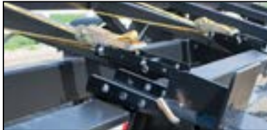
Two fully adjustable ratcheting straps for securing all brands of heads