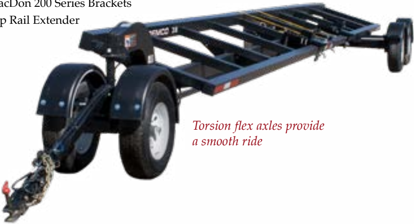
Torsion flex axles provide a smooth ride

HOW TO ORDER: 1. Choose Header Transporter 2. Review Options