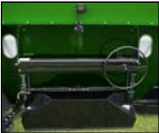
Adjustable Door Opener with Larger Hand Wheel