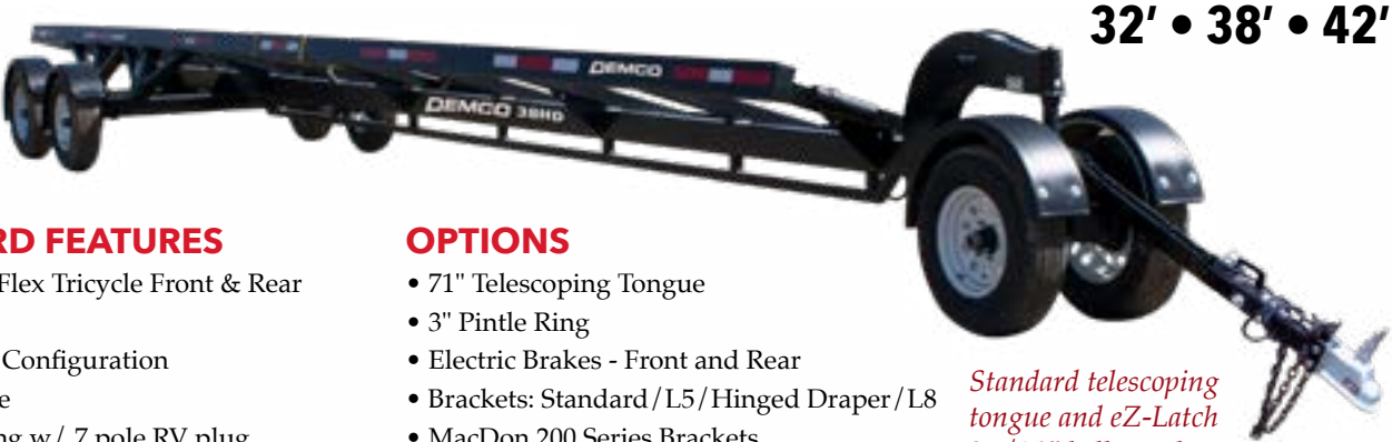
Standard telescoping tongue and eZ-Latch 2 5/16" ball coupler and safety chains