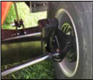
Cast Spindle Carriers - front and rear