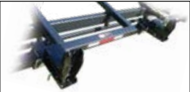
Cotton Head brackets and extender kits available. Contact your Demco Rep for part numbers and pricing.

HOW TO ORDER: 1. Choose Header Transporter 2. Review Options