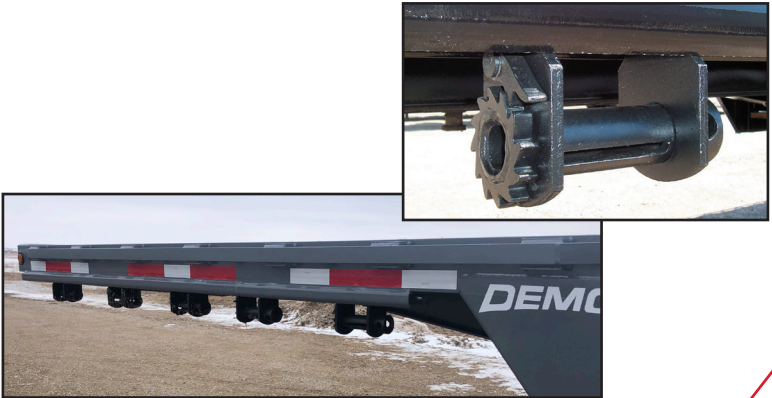
WINCH TRACK Track is standard on the driver's side (optional on passenger's side), sliding winches optional