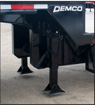
HOLLAND ATLAS 55 LANDING GEAR 55,000 lb capacity