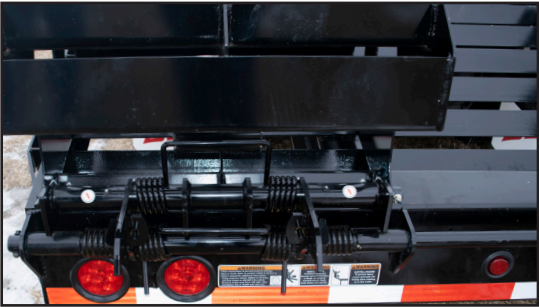
4 SPRINGS PER RAMP 2 springs assist in raising and 2 springs assist in lowering