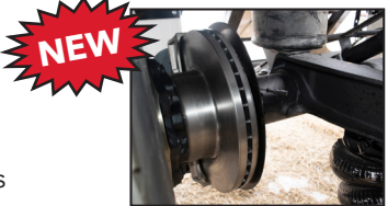
NEW DISC BRAKES