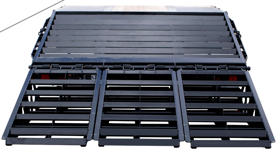
BEAVER TAIL WITH 3 RAMPS