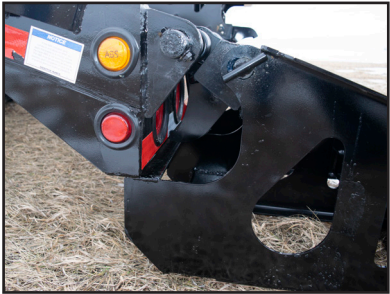
DOUBLE HINGE RAMP with built in stabilizer