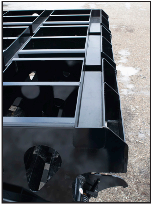
RAMP DESIGNED TO CARRY EXTRA CARGO Groove fits 2x4 board