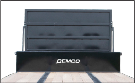
FRONT BULKHEAD Removable