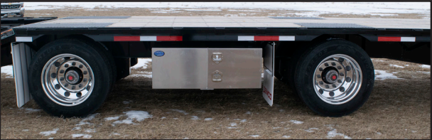
TOOLBOX Located between wheels or up front