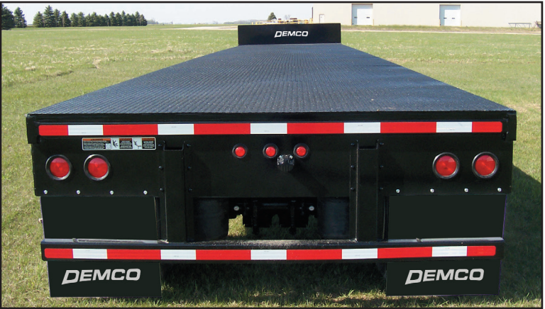
STEEL FLOORING 48' & 53' no beavertail