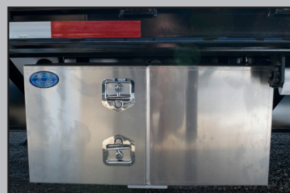
ALUMINUM TOOLBOX Aluminum, enclosed toolbox - up to 2 on passenger side and 2 on driver side