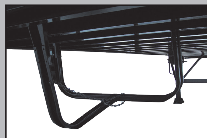
SPARE TIRE CARRIER