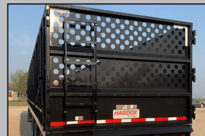
VENTED TAIL GATE Optional vented tail gate