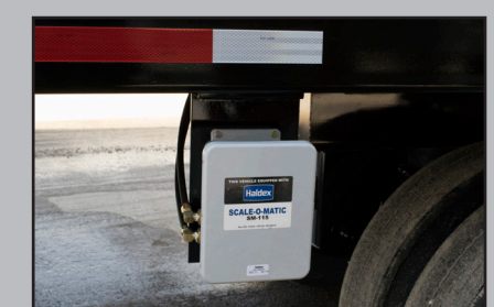
SCALE Haldex Scale-O-Matic