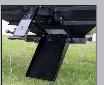
SIDE CHUTE for Swing Auger Applications