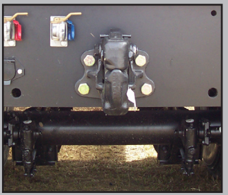
PINTLE HOOK Spring and Air Ride