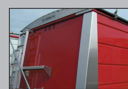
ALUMINUM PLATFORM Located on Front and Rear