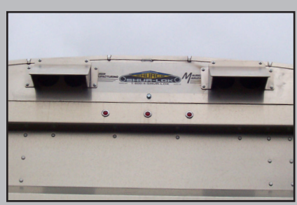
VENTED HOPPER Located on Front and Rear