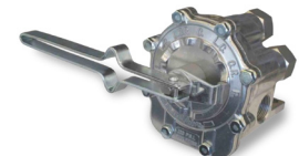
Valve for selective control of three section boom sprayers