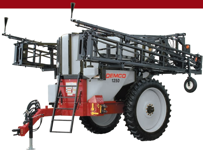
How the Hydraulic Glide Suspension works Unique hydraulic glide suspension system makes the boom wings weightless. The glide wheels activate the hydraulic system and automatically adjust for uneven terrain. Glide wheels have puncture proof tires. (optional)