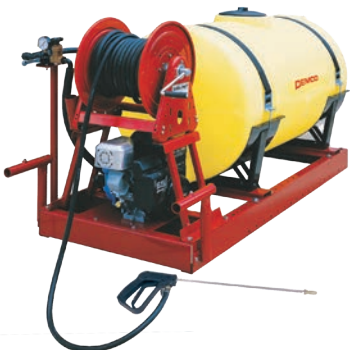
110 & 150 GALLON SKID SPRAYERS Perfect for acreage spraying, the 110 or 115 gallon Pro Series sprayer can mount in the back of your pickup or flatbed trailer. The heavy duty form steel skid frame is built strong with the high quality you expect from Demco.