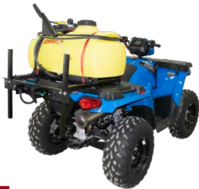
14 & 25 GALLON The 14 and 25 gallon are high quality ATV mounted sprayers. Great for spraying weeds on your lawn, garden, or acreage.