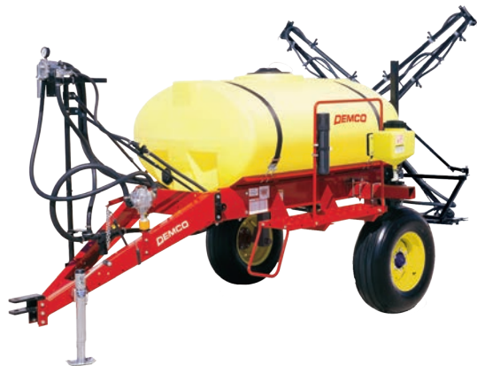
Demco's 300 Gallon Single Axle Sprayer with a 21', 30', or 40' boom has polyethylene elliptical tank with two dual jet agitators and sump.

Demco field sprayers give you the flexibility of size suited to your crops (between 300 and 1250 gallon capacities) while also providing the configuration you need to apply chemicals exactly how you want to. With multiple axle and wheel designs, you can find the perfect field sprayer for the terrain you'll be working with.