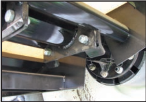
Easy attach tank mounts