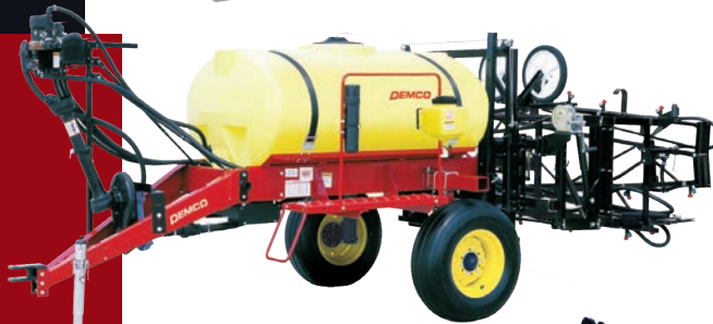
300 Gallon Deluxe Single Axle with a 28' 30' or 45' boom has 10 gauge formed steel trailer with 27" ground clearance.