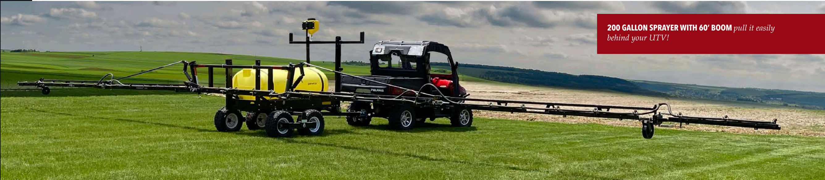
200 GALLON SPRAYER WITH 60' BOOM pull it easily behind your UTV!