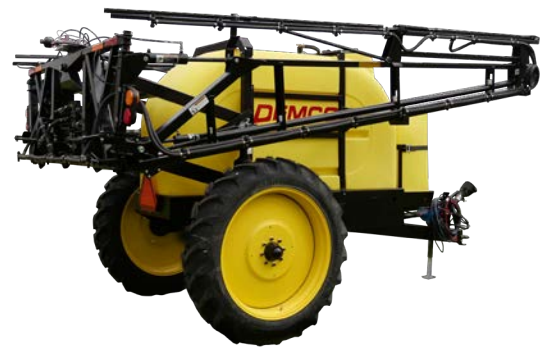
600 Gallon Big Wheel available with 60' or 45' FF or 60' or 45' x-fold booms, this sprayer has a 600 gallon tank with 16" fill wells, large center drain sump and high volume jet agitator.