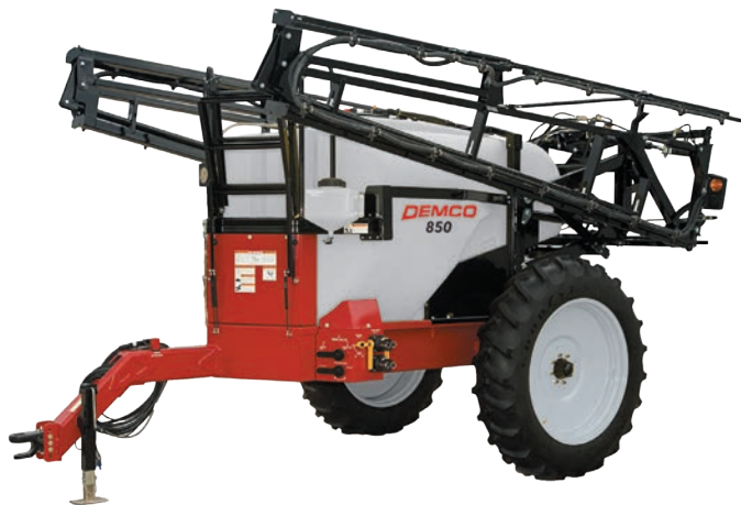
Demco's 850 Gallon and 1050 Gallon Big Wheel Sprayers with 38" wheels and tires are part of our 50 Series Sprayers line. They boast a shorter hitch pin to axle length which dramatically reduces crop damage.

The hydraulic front fold booms feature a nitrogen charged accumulator system combined with leveling linkage and shock absorbers to soften the ride. Live hydraulic control block requires only one set of remote outlets to perform all boom functions.