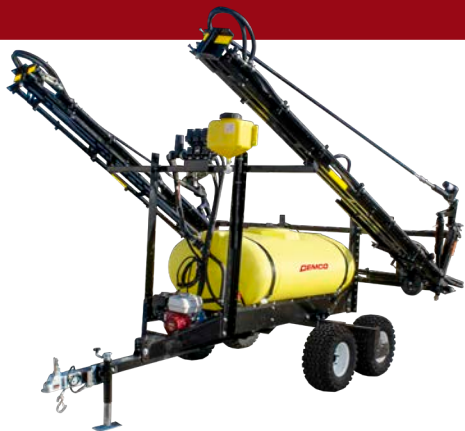
150 & 200 GALLON ATV SPRAYER The largest capacity Pro Series sprayers are the 150 and 200 gallon sprayers. These single or tandem axle sprayers are perfect for pulling behind your ATV, UTV, or small tractor for spot spraying or spraying small fields or pastures.