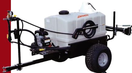
40, 60, & 80 GALLON The versatile 40, 60, & 80 gallon sprayers can be purchased as a skid mount, a rear mount, or as a trailer. These sprayers contain a molded-in baffle for enhanced agitation, a deep sump for uninterrupted application and complete product clean-out. Demco Pro Series sprayers are not your "off the shelf" mass-produced sprayer. These are high quality sprayers for your lawn, garden, and acreage applications.