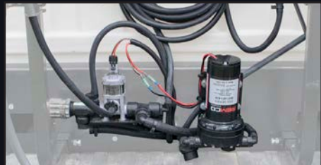
ELECTRIC PUMP AND BOOM CONTROL