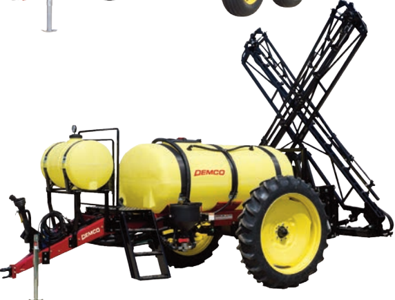
500 Gallon Big Wheel with a 45' or 60' boom has a 500 gallon polyethylene elliptical tank with two dual jet agitators.