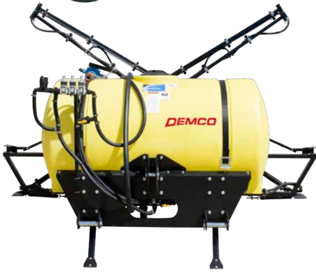
RM SERIES: 150, 200, & 300 GALLON The Demco RM Series sprayers are 3 point mounted sprayers available in capacities of 150, 200, or 300 gallons.