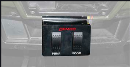
IN-CAB CONTROL CONSOLE makes it easier to control your pump and boom

Our high quality lawn and garden sprayers have the agitation and sturdy design you need to keep up with your plants. Each tank is specially built for optimal flow and functionality you don't find on store shelves. Enjoy a molded-in baffle system for optimal chemical suspension and uninterrupted application so you can fill and go.