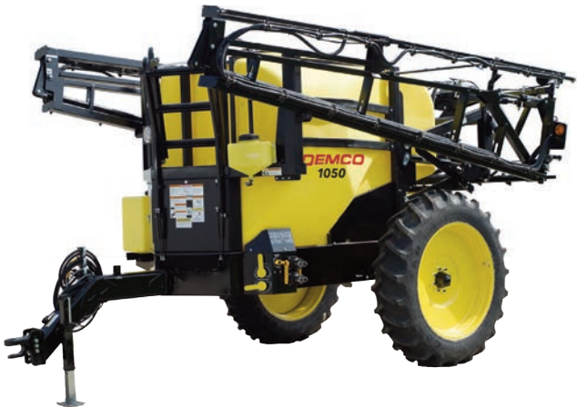
Demco's 1050 Gallon and 1250 Gallon Big Wheel Sprayers with 46" wheels and tires are part of our 50 Series Sprayers line. They boast a shorter hitch pin to axle length which dramatically reduces crop damage.