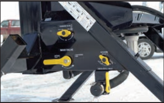
Easy access controls

Extended rear axle spindle mount allows weight to be shifted to the rear, relieving stress on the tractor's front axle and chassis. Units will fit on tractors with or without front duals. Rear duals are required.