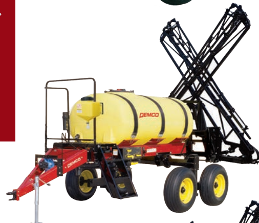
500 Gallon Tandem Axle with a 45' or 60' DFB boom offers manual rear folding, auto leveling and flotation suspension.