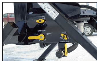
Easy access controls

Extended rear axle spindle mount allows weight to be shifted to the rear, relieving stress on the tractor's front axle and chassis. Units will fit on tractors with or without front duals. Rear duals are required.